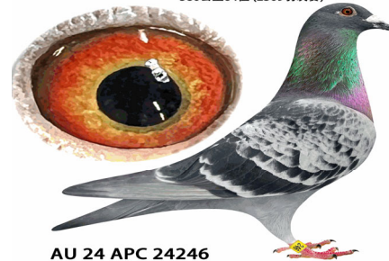
AU 24 APC 24246

64th 360m (2309 bird) 580公里64位 (2309羽决赛)