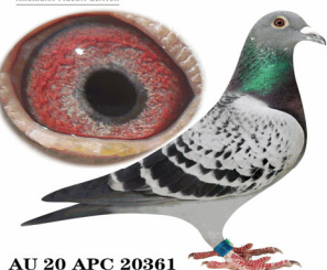
AU 20 APC 20361

1.Dau 24246 won 64th 360m @1554ypm,had 15th a. speed 2.Dau 24123 won 359th 360m @1138ypm Hoosier Classic, 2024 Full sister 20019 had 1st 150m @1360ypm Crooked River, 2021 Half sister 17111 won 20th average speed from 7 races Plymouth Peak, 2017