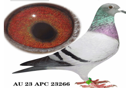
AU 23 APC 23266