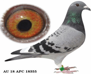
AU 18 APC 18355

Bred Dau 22235 won 56th 354m @1556ypm Black Gold 2022 Bred Dau 21214 won 238th 350m Hoosier Classic, 2021