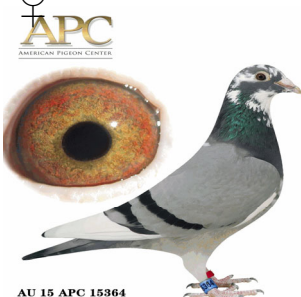
AU 15 APC 15364

Bred Dau 21349 had 4th average speed 5 races 1st e. 15th 200m @1483ypm 1st e. 15th 350m @1728ypm Tucson Triple Challenge, 2021 Half sis 17051 won 9th 325m @1369 ypm Southern Belle, 20 Half brother 16318 won 36th 350m @1632ypm Big Andy, 2016