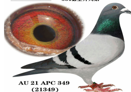
AU 21 APC 349 (21349)