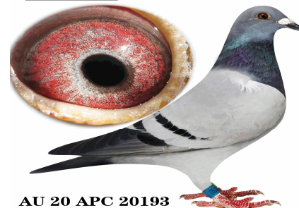
AU 20 APC 20193

547公里并列冠军8位 @1365ypm 1st e. 8th 340m @1365ypm