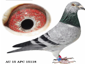
AU 15 APC 15118

Won 1st e 18th, 150m@1538ypm Won 1st e 9th, 200m@1369 ypr 1st e 5th,300m@1668ypm Luck Bred Dau 18231 won 25th 334r & 9 average speed from 4 races Golden Country Challenge 2018 Bred Dau 19259 won 9th 350m 2nd average speed from 4 races Dau 20193 won 1st.e 8th 340m Dutch Touch Int'l, 2020